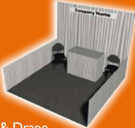
Pipe & Drape Booth Package